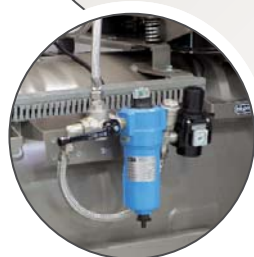
Filtration air (3µm)