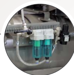
Filtration air (5+0,1µm)