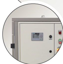
External text display with Ethernet port